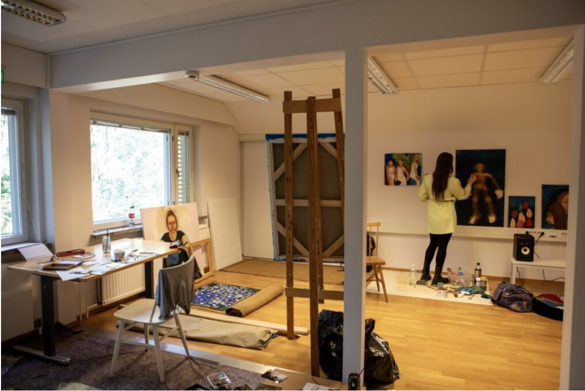
(in picture: Salla Kuoppamaa)